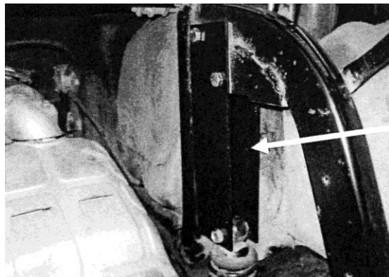
Placement of Rear Shock Extensions